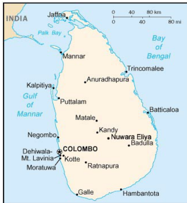
Map of Sri Lanka.

Although the views are incredible, travel to this region is limited by narrow, windy, and bumpy roads in poor condition.