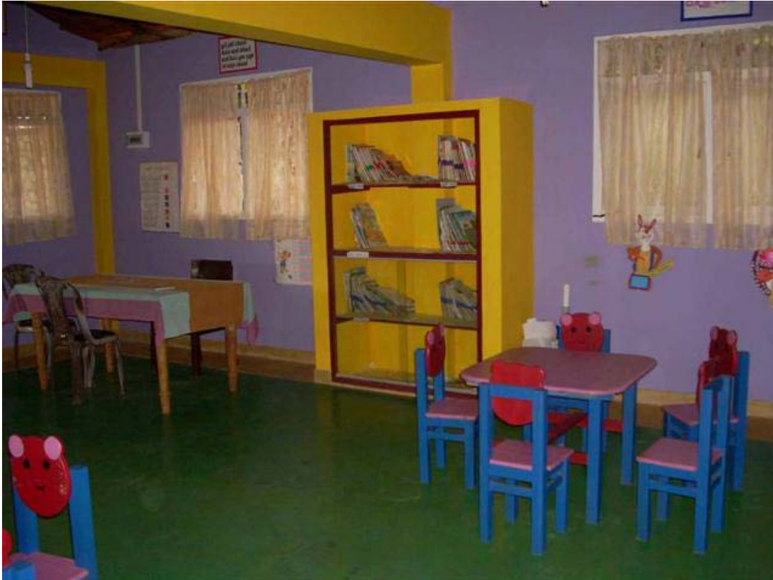
The interior of the Constructed Reading Room is also painted in bright colors.