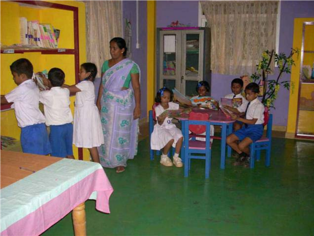
The students rush to the bookshelves to select new books during their scheduled library time.