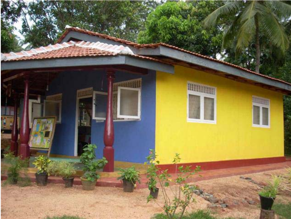
The Constructed Reading Room is painted in bright colors.