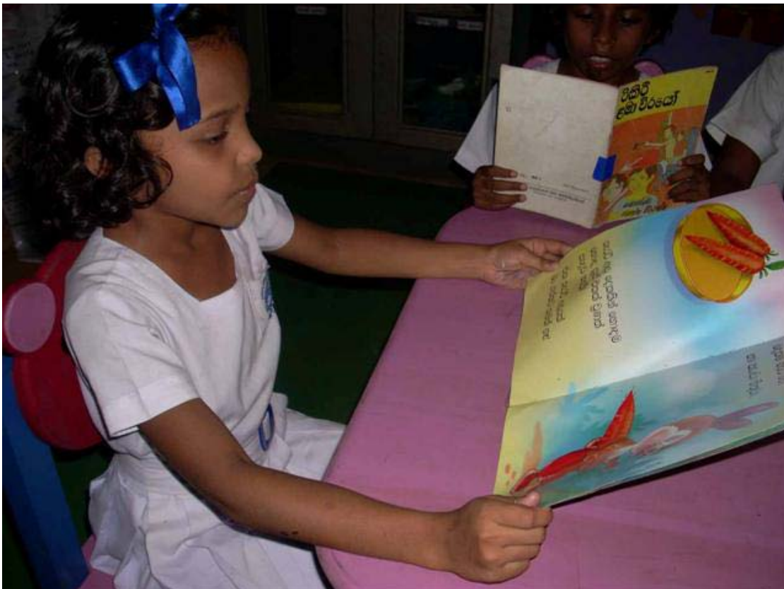
This student enjoys the new picture books provided by Room to Read.