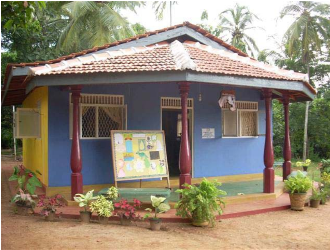
The entrance to the Constructed Reading Room.