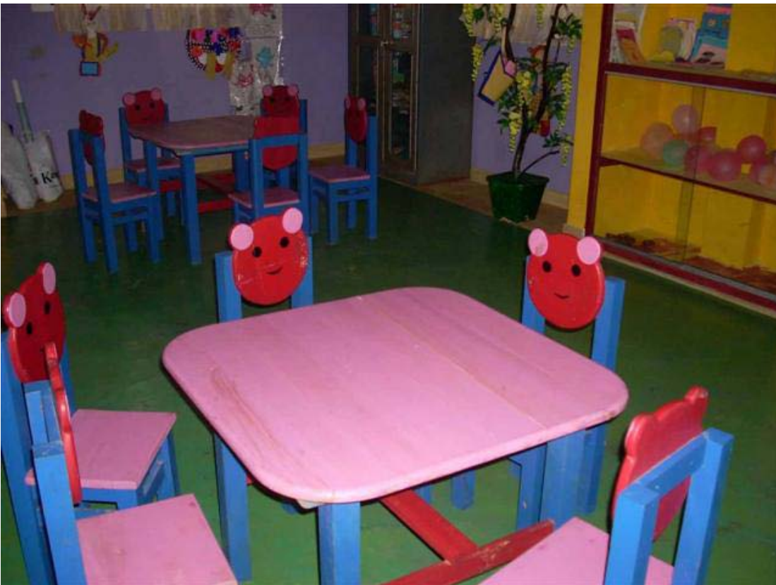
Room to Read provided colorful furniture for the Constructed Reading Room.